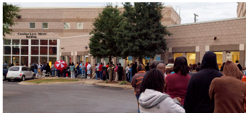
Waiting for Services at Crisis Assistance Ministries in Charlotte, NC.